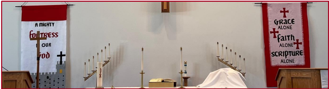
Beautiful new banners proclaim the Reformation message.

"...and the truth will set you free" John 8:32