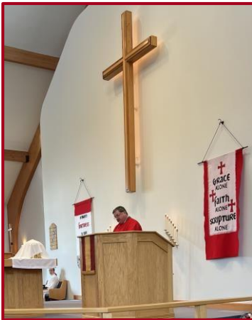
God's Word proclaimed.