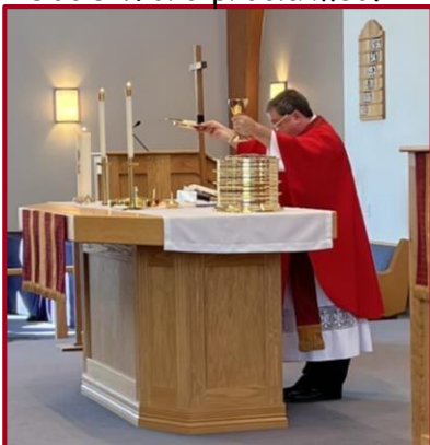
...given and shed for us...