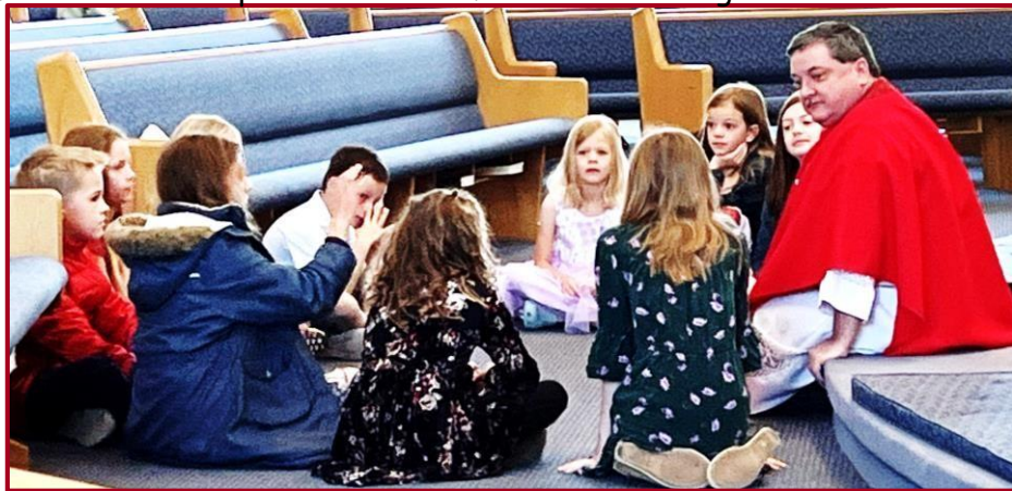
...for the kingdom of heaven belongs to such as these.