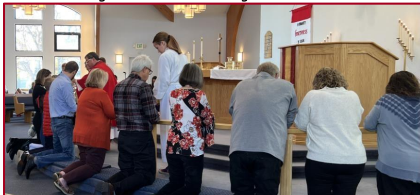
In unity of faith and confession, we receive the sacrament.